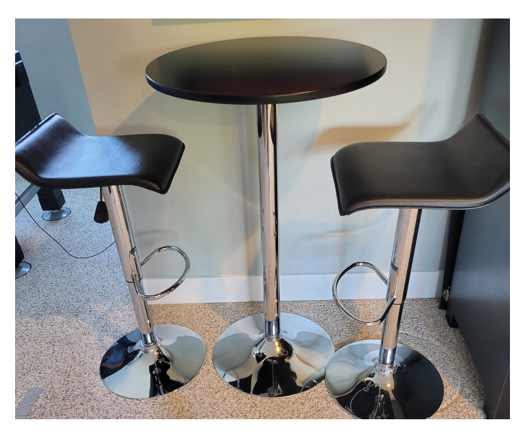
Gently used Bistro table and two stools $325.00.