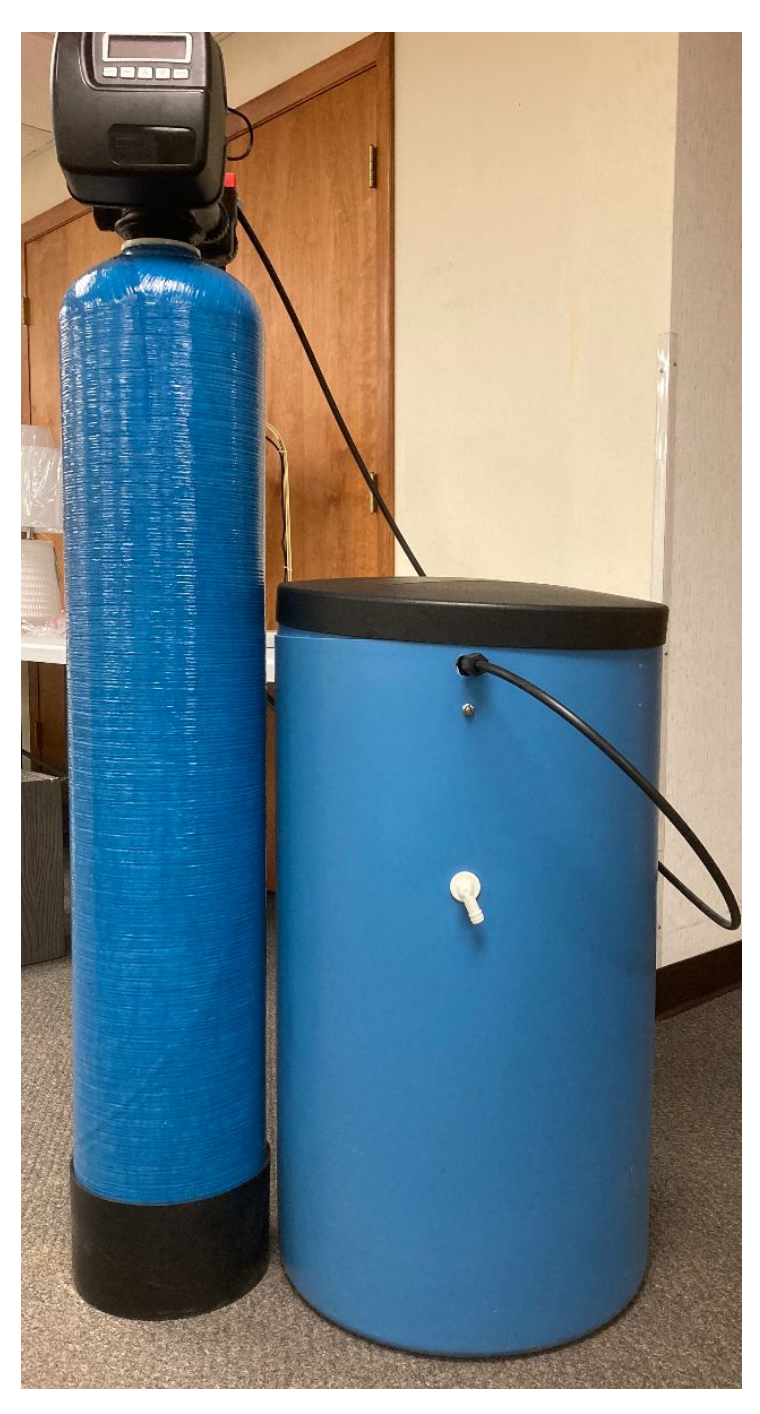
Brand New Multi-Stage Filtration System. On display at the MBE showroom. $3200.00