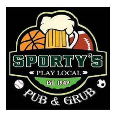
A hometown staple since 1949, Sporty's Pub &

CURRENTLY BUYING USEABLE PALLETS. Call MBE for details, 269-344-8800.