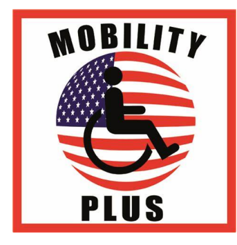
Stay in your home with convenience and safety.

Locally owned & operated. Call 269-360-7911