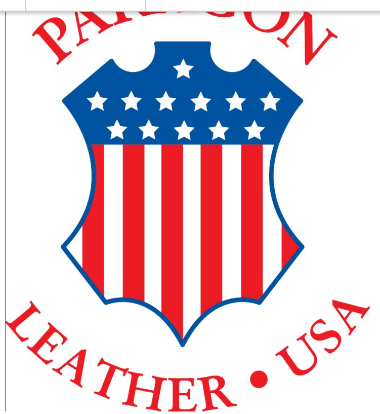
For 33 years, Paragon Leather has been synonymous with protective leather clothing and accessories for motorcyclists.

Call Gill at 269-343-9483 and set an appointment to meet at 10210 Shaver Rd to see the full collection of gear.