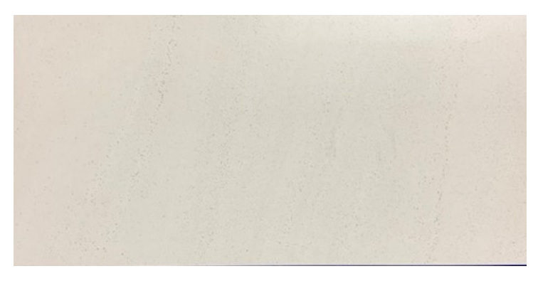
12"x24" floor tile. Polished floor tile.

Call MBE at 269-344-8800 for pricing and availability