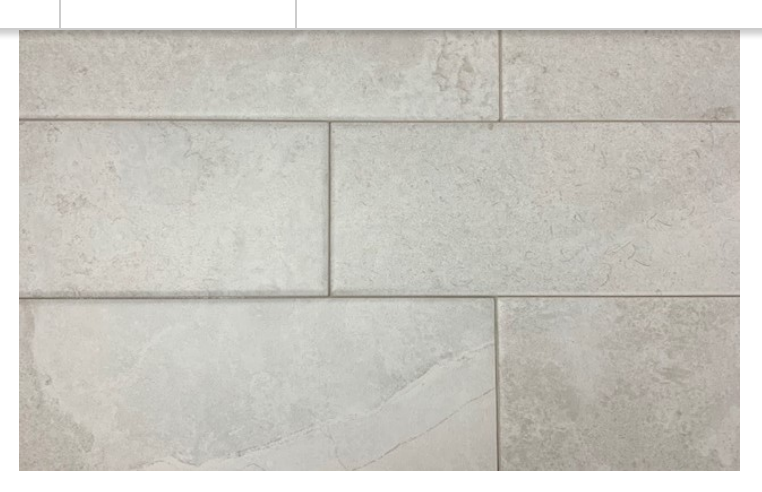
4"x12" wall tile. Perfect for backsplash or shower surround