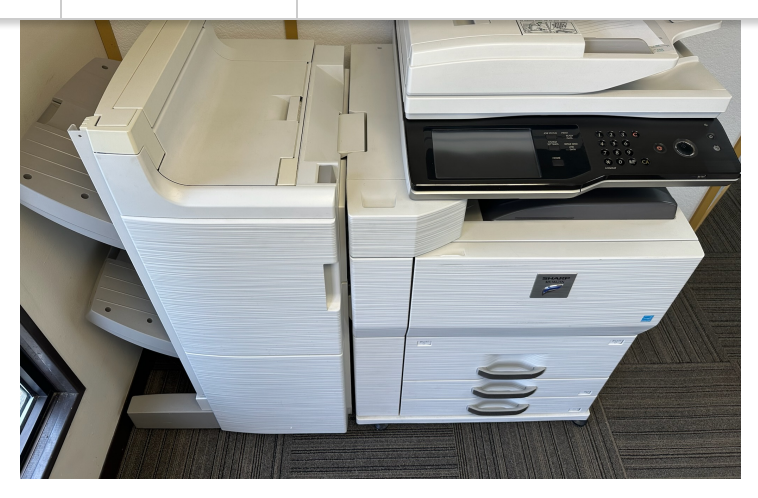
Sharp MX-M623N Copy/Print/Scan Black & White for copies/prints 62 pages per minute Color for Scans

Finisher: 4,000 Sheet capacity -Service Agreement Available-