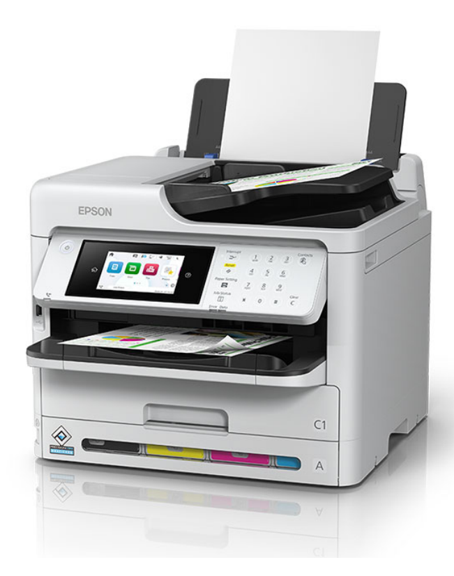
Epson Workforce Pro WF-C5890 Print/Scan/Copy/Fax (All in color) Lowest power consumption in its class

Call Lance at MBE 269-344-8800, for details.