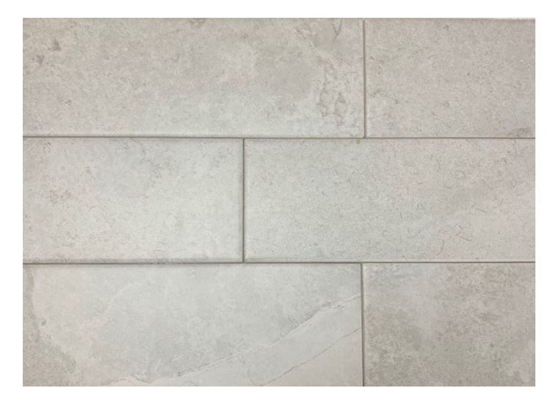
4"x12" wall tile. Perfect for backsplash or shower surround