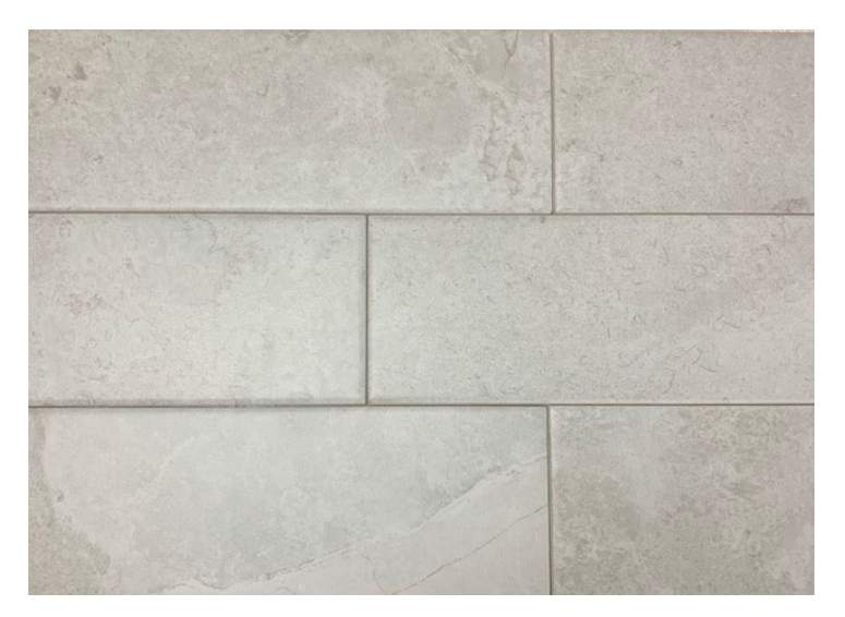
4"x12" wall tile. Perfect for backsplash or shower surround