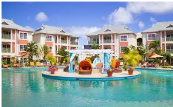
Bay Gardens Beach Resort & Spa