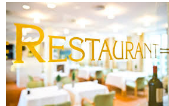
Restaurants and Bars On TRADE