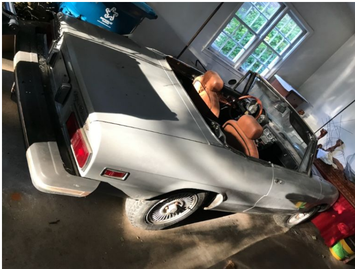
1973 Alfa Romeo Spider Project Car Call MBE 269-344-8800

If you have missed any of our email blasts, please go to www.mbebarter.com , click Members and then Barter Deals