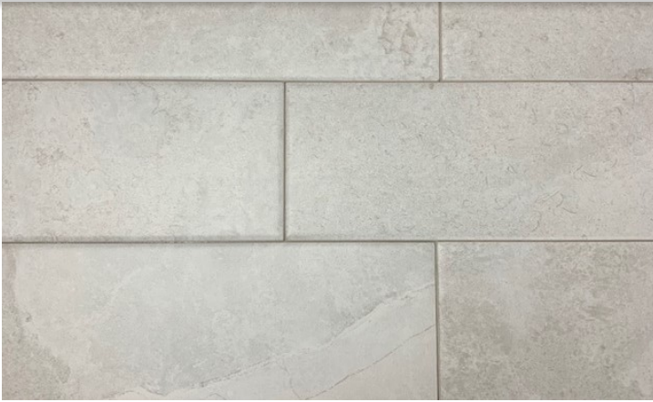
4"x12" wall tile. Perfect for backsplash or shower surround