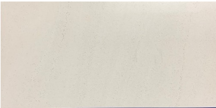
12"x24" floor tile. Polished floor tile.

Call MBE at 269-344-8800 for pricing and availability