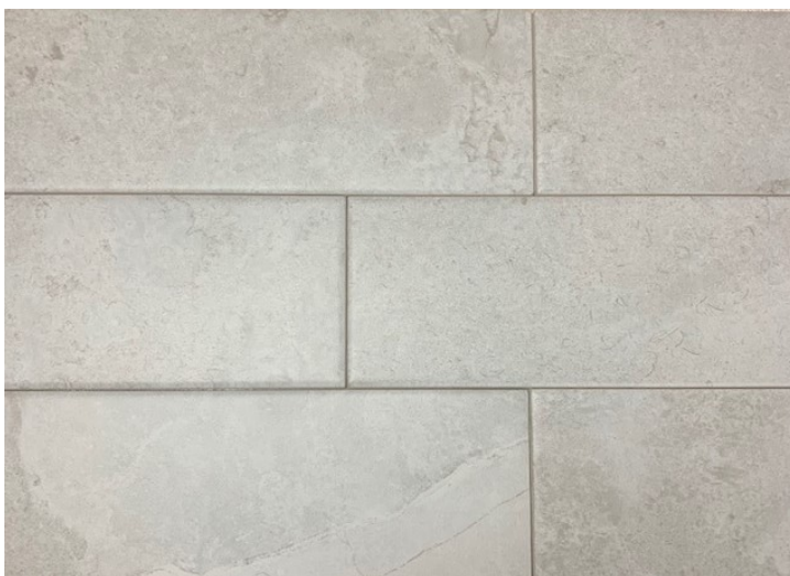
4"x12" wall tile. Perfect for backsplash or shower surround