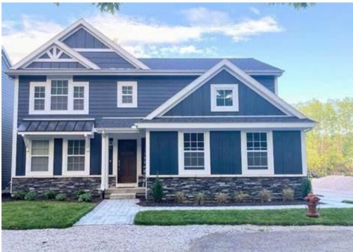
Enjoy a beautiful MI Winter in South Haven at the Harbor Club Resort & Marina . The home at 720 Ravine Ln sleeps 14 and is across the street from an indoor, heated pool available to guests.