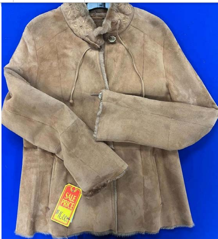
Camel hair shearling jacket with decorative collar. $1600.00