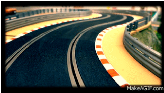
SLOT CAR RACING