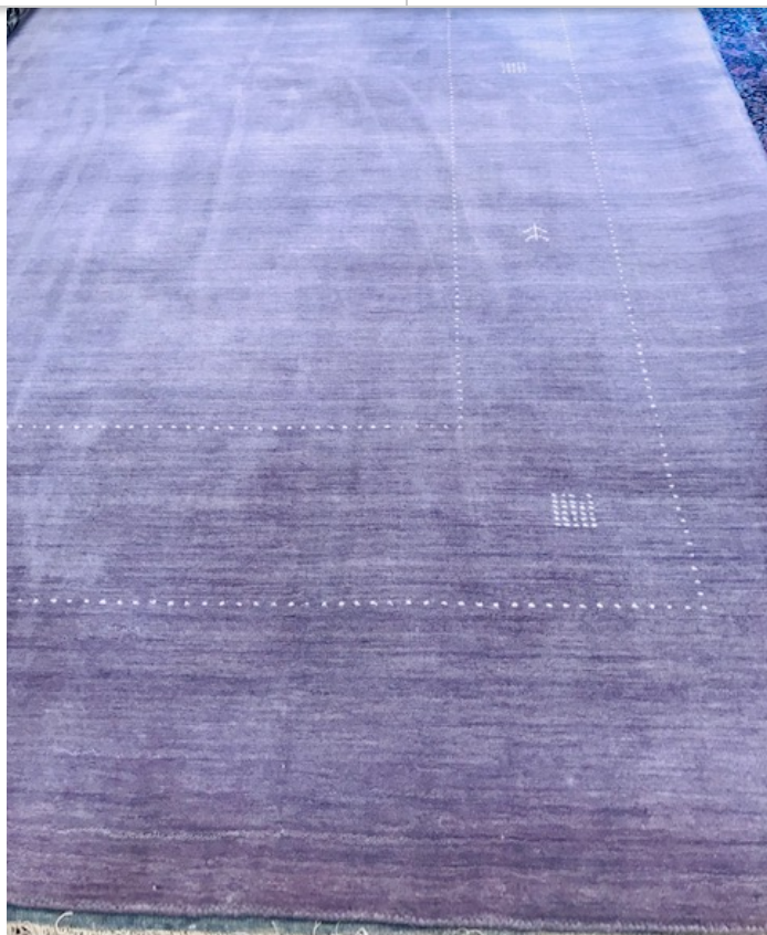
Gabbeh 8 by 10 Persian Wool Rug $2100.00 Trade Call MBE 269-344-8800