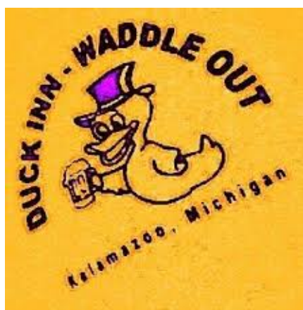
A Kalamazoo institution as always located at 3214