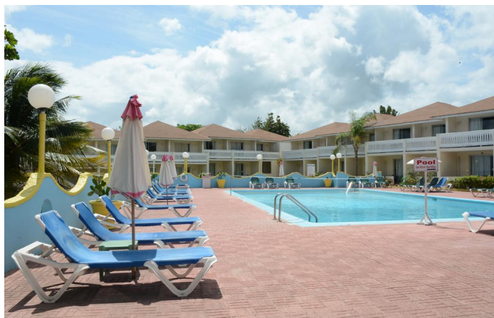
Club Ambiance (All Inclusive)

Based on availability and cannot be canceled. Does not include flights.