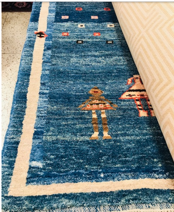
Tibet Rug 4 by 6