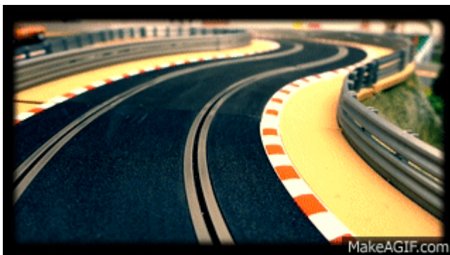
SLOT CAR RACING