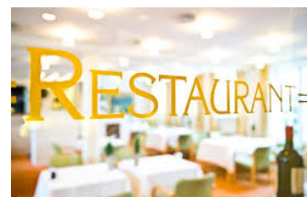
Restaurants ON MBE

Please call Lance or Omar for reservations at 269-344-8800 only.