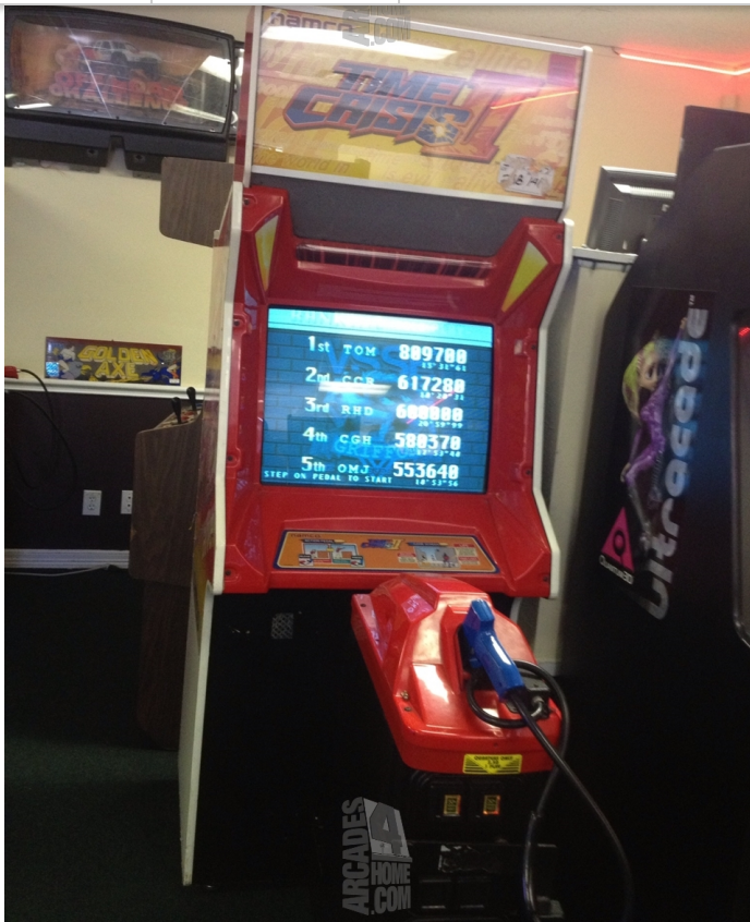
Time Crisis II video arcade.