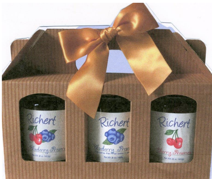
Michigan Made Products Richert Blueberry .

Holiday Gift Giving for vendors, clients, family & friends. Pre-order boxed, three packs of Blueberry