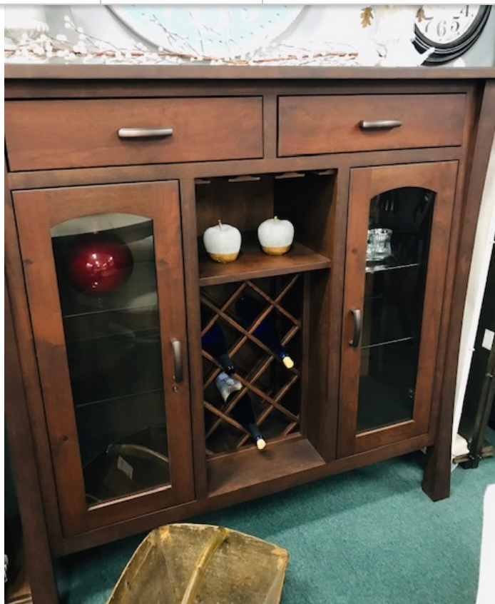
New Amish style crafted Buffet.