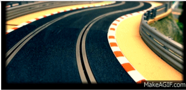
SLOT CAR RACING