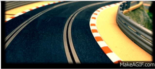
SLOT CAR RACING