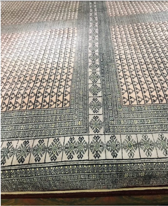
10 by 14 Bokhara rug $2500.00 trade