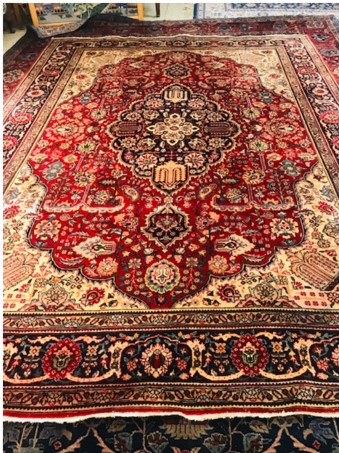
9 by 12 Tabriz wool Persian Rug. $2500.00 Trade