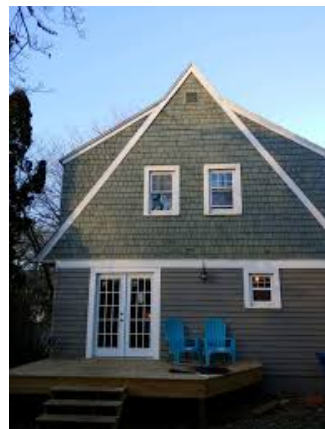
AirBnB Kalamazoo Need a spot for out of town