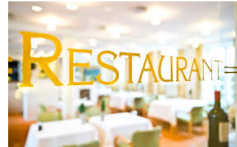
Restaurants ON MBE