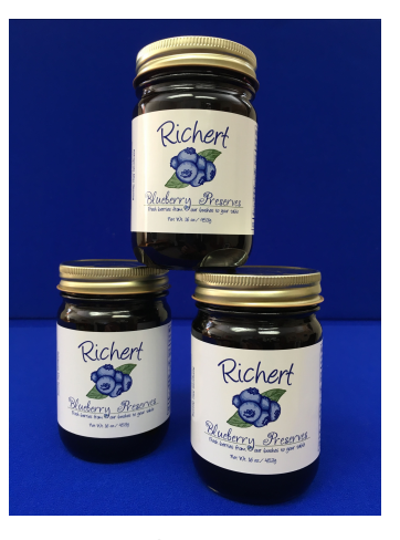
Blueberry Season is upon us. Richert Family Farm, 16 oz Blueberry Preserves . Case of 6 for $48.00.