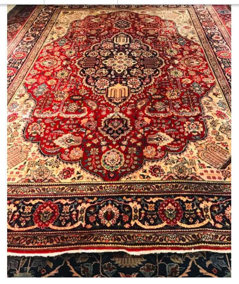
9 by 12 Tabriz wool Persian Rug. $2500.00 Trade