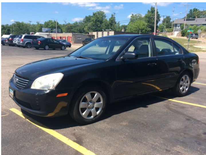
2007 Kia for sale

173,000 miles 4 door automatic Transmission.