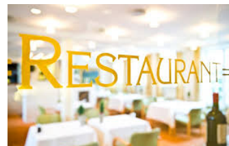
Restaurants ON MBE