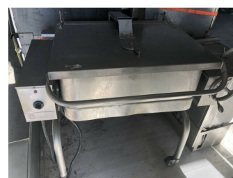
Hobart Vulcan Tilt Skillet.

For training in CPR or First Aid . Also offering training and prep for concealed carry pistol license on MBE. Call Brett or Cory at 269-350-4494.