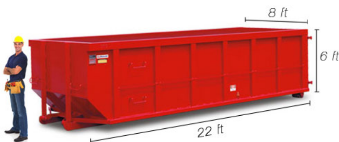
30 yard dumpster

Are you sick of your clutter? Call Dave at Ace Excavating, 269-383-4140. 30 yard dumpster rental for $500.00 per week. $150.00 cash drop charge. No concrete, please.