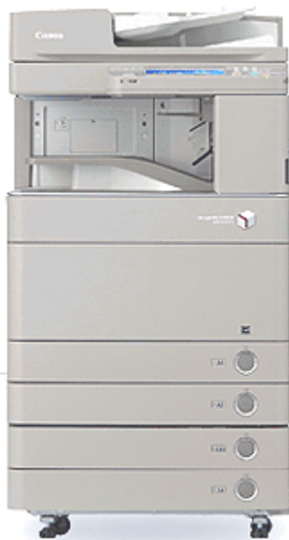
Canon image RUNNER ADVANCE C5035