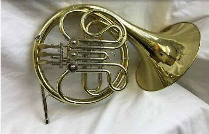
Lightly used Yamaha YHR-314 French Horn. Just in time for band or jamming at home. Includes hard case, $1700.00, call MBE at 269-344-8800..