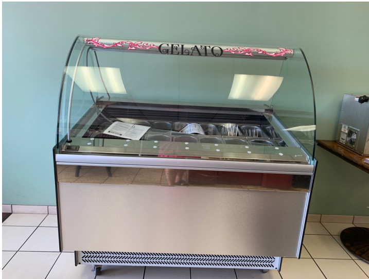
R and C Gelato Machine. $5500.00 trade.