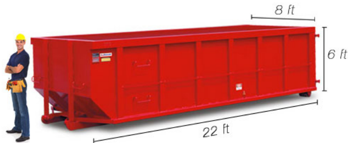
30 yard dumpster

Are you sick of your clutter? Call Dave at Ace Excavating, 269-383-4140. 30 yard dumpster rental for $500.00 per week. $150.00 cash drop charge. No concrete, please. .