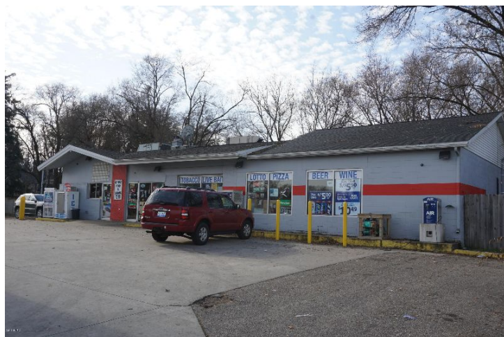
Sunoco Gas Station.