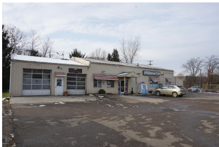
Established beverage emporium