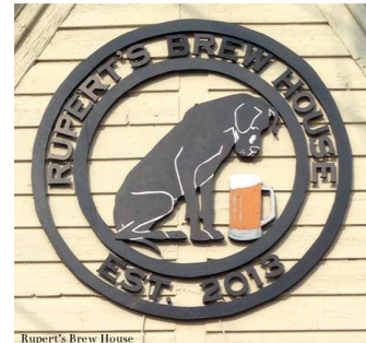
Rupert's Brew House