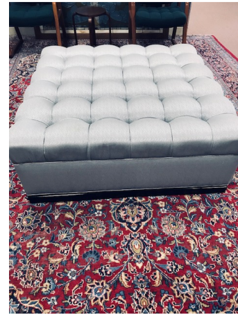
Ottoman 48" x 48" Display Model 1700.00 Trade Call MBE at 269-344-8800

The Local at 9805 M-89 in Richland is the go to for Pizza, Wraps, Subs and Burgers. "Eat Local, Drink Local, Live Local!" Call 269-629-6160 or stop in M-Th 10 a.m.-11 p.m., Fri-Sat 10 a.m.-Midnight, Sun, Noon-10 p.m.